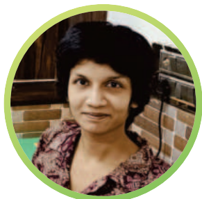
SAHITHYA.DEODHARE CONTENT WRITER